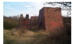
Adamant Cement Works. “The Old Cements”