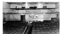
Interior, Old Oxford cinema