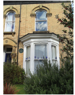
46 Westfield Road