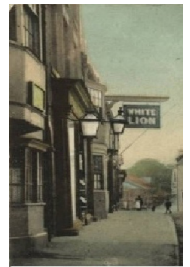
The White Lion